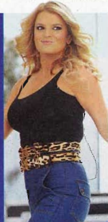
The 5-foot-3 Simpson weighed an estimated 135 pounds on Jan. 25.

If Simpson has been finding comfort in food, she's got company, says Judith Beck, author of The Complete Beck Diet for Life . "Eating distracts you from your negative emotion and offers a temporary fix," Beck tells Us of emotional eaters caught in the cycle. "But now they have two problems: the original one, and also feeling badly about gaining weight. They tend to again look to food to comfort themselves."