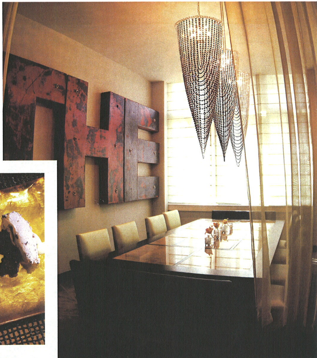
THE SPOT Above: The chef's table sits pretty under nostalgic lettering. Left: Mini cannoli with blackberry gelato and creme fraiche.