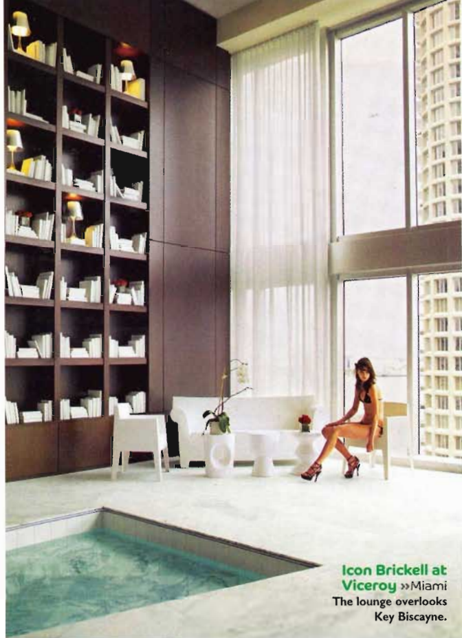
Icon Brickell at Viceroy »Miami The lounge overlooks Key Biscayne.

From the warm ginger tea given to guests on arrival to the red kimonos and lemongrass-scented eye mask applied during treatment, every detail at the Shibui Spa has been considered. Located in the basement of the Greenwich Hotel (see "Hot List"), this Asian-style spa takes its name from the Japanese word for "a subtle and unobtrusive approach"—a concept it takes very seriously. Treatments focus on balancing the body systems by combin-