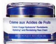
CRÈME AUX ACIDES DE FRUITS Ambassade de la Beauté, Biologique Recherche's Paris flagship, uses natural ingredients to brighten and hydrate in its fragrance-free botanical creams.

Treatments' corn and honey components come from the high desert environs.