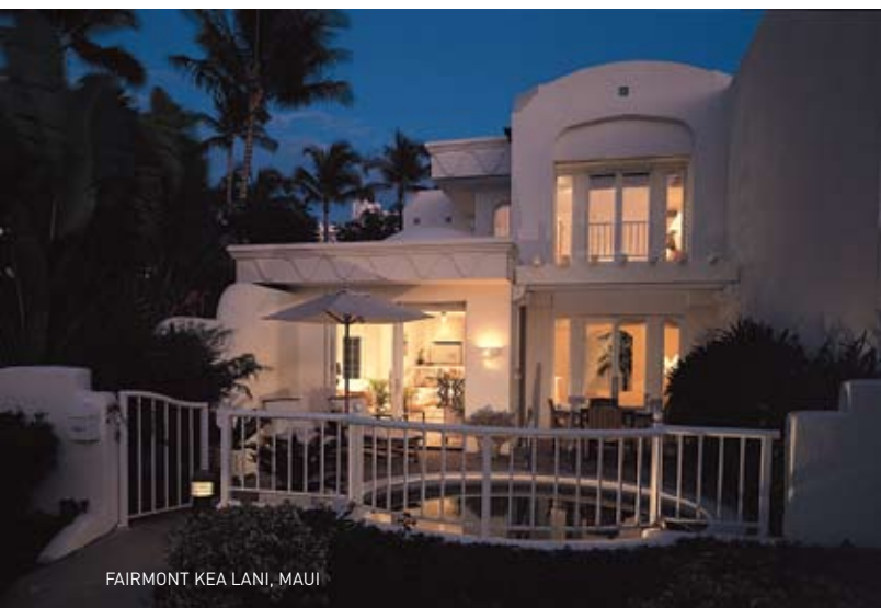
FAIRMONT KEA LANI, MAUI