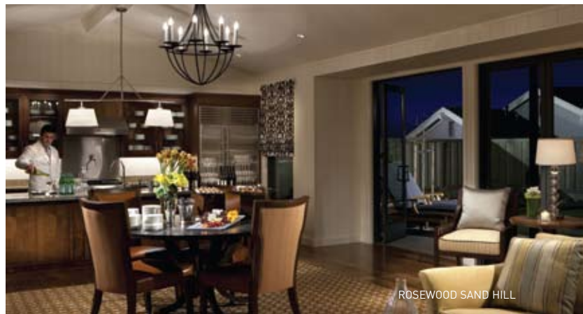
ROSEWOOD SAND HILL