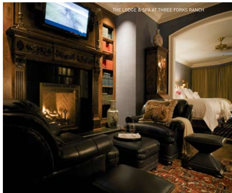
THE LODGE & SPA AT THREE FORKS RANCH