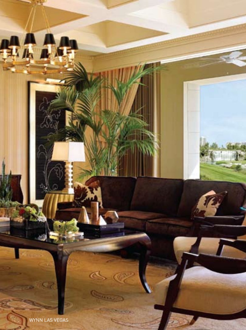
WYNN LAS VEGAS