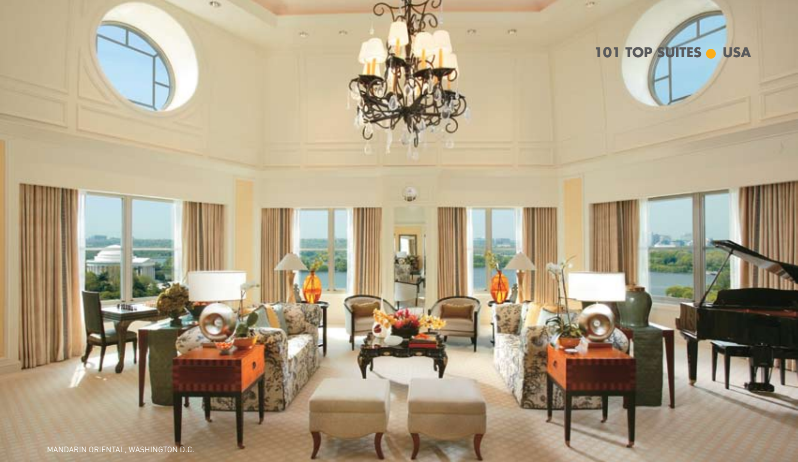
MANDARIN ORIENTAL, WASHINGTON D.C.