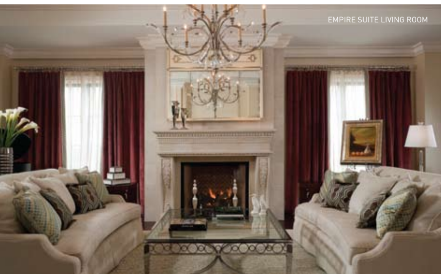
EMPIRE SUITE LIVING ROOM