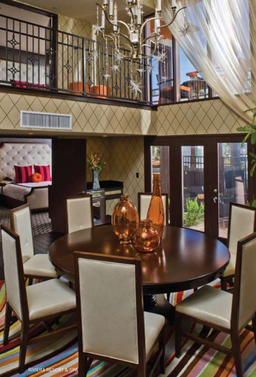
RIVIERA RESORT & SPA