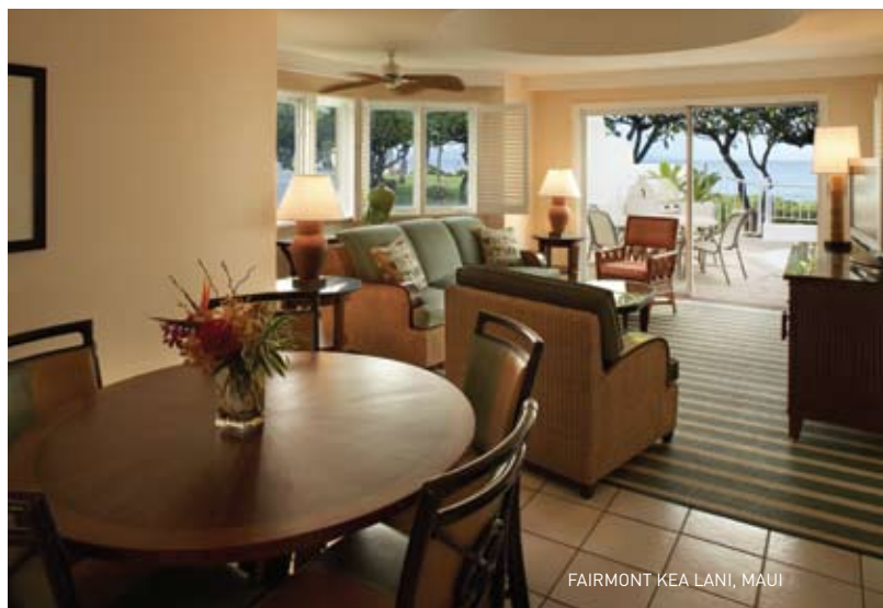
FAIRMONT KEA LANI, MAUI