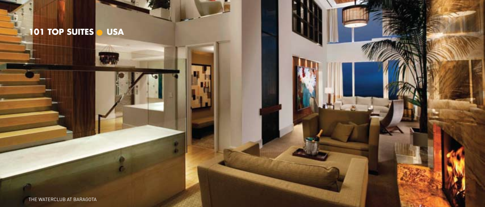
THE WATERCLUB AT BARAGOTA