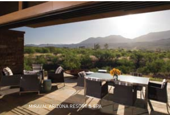
MIRAVAL ARIZONA RESORT & SPA