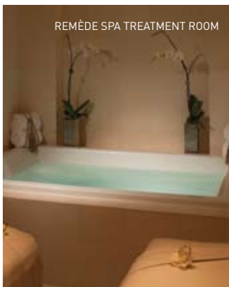
REMÈDE SPA TREATMENT ROOM

Also, St. Regis Butlers, a multi-lingual Concierge and a special events staff are at the ready to meet every need.