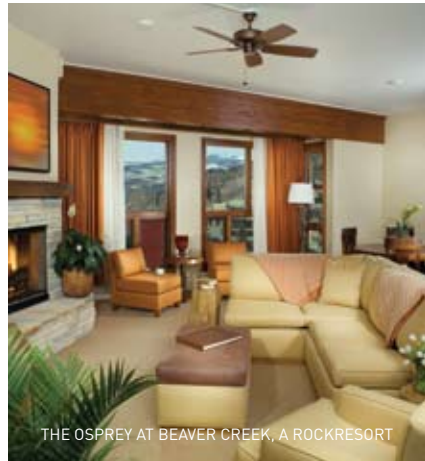
THE OSPREY AT BEAVER CREEK, A ROCKRESORT

of the mountains. The private hot tub provides a great spot to unwind after a day on the mountain and downstairs offers a fantastic sushi bar."