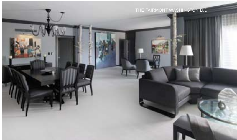
THE FAIRMONT WASHINGTON D.C.