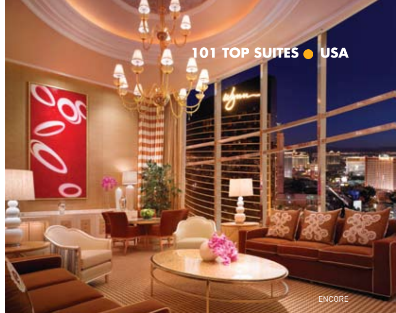
101 TOP SUITES ● USA