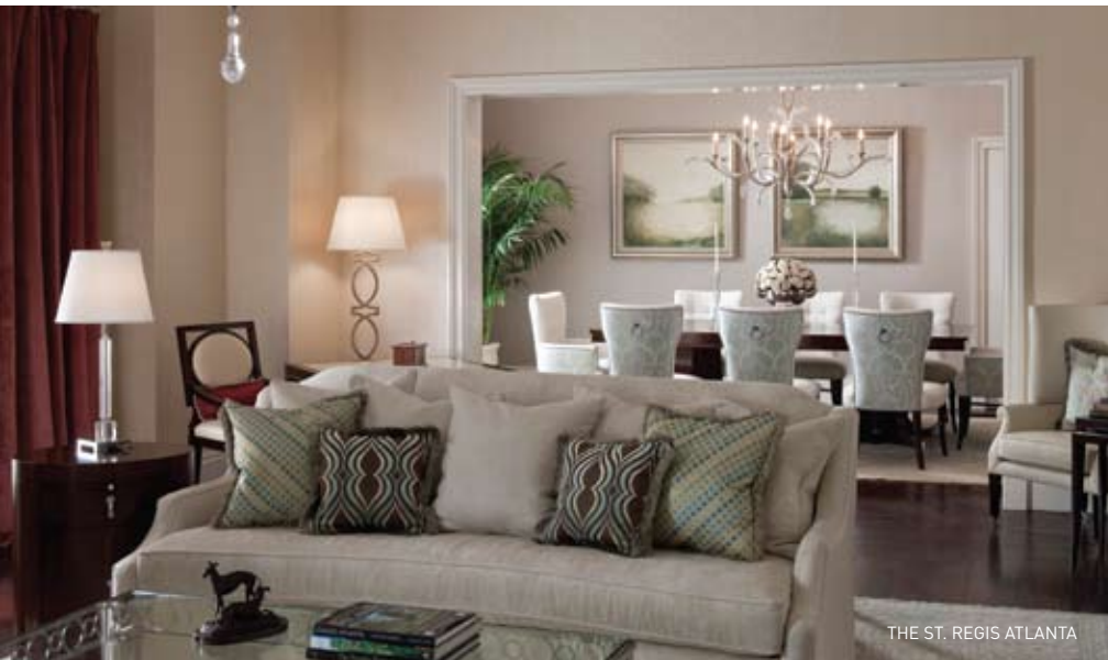
THE ST. REGIS ATLANTA