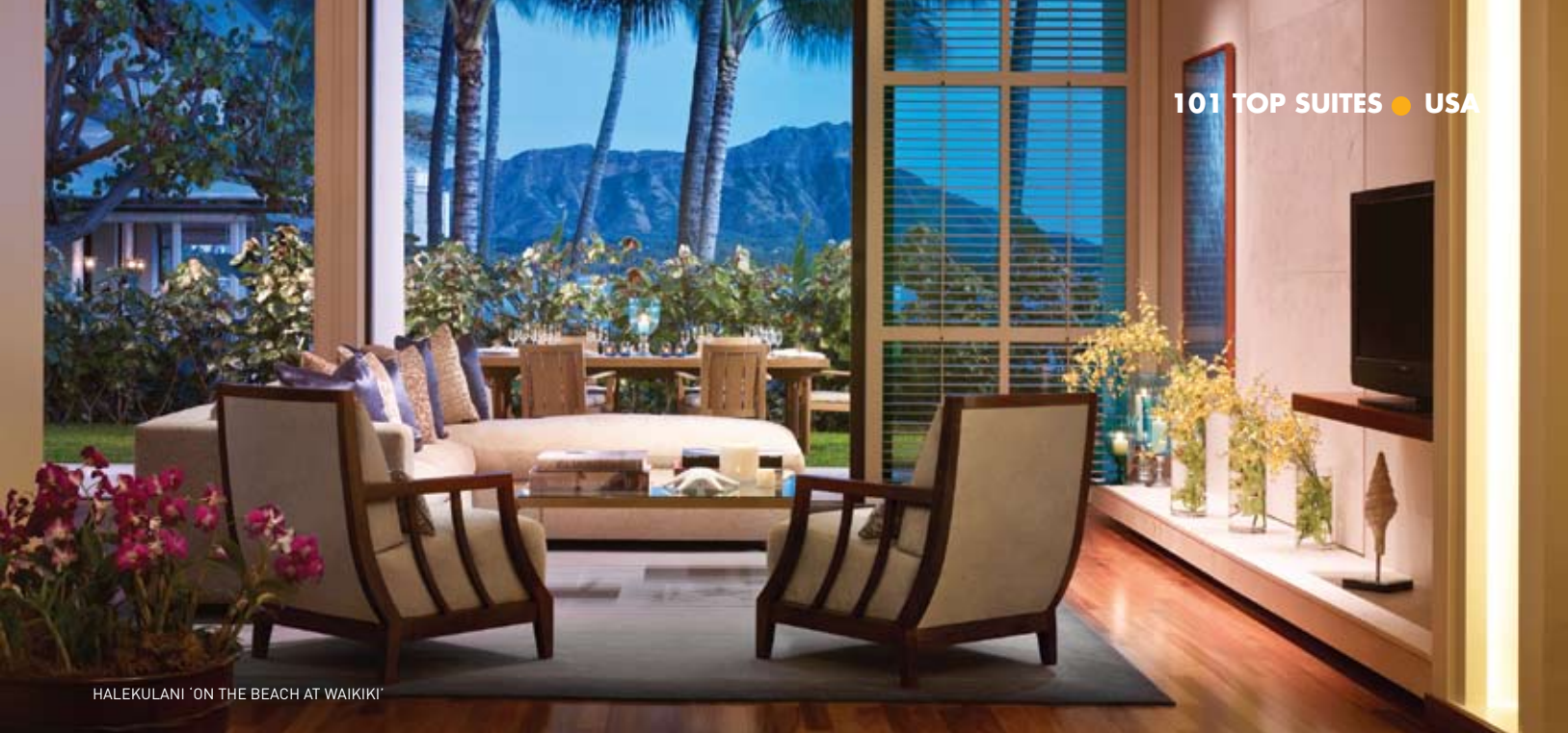
HALEKULANI 'ON THE BEACH AT WAIKIKI'