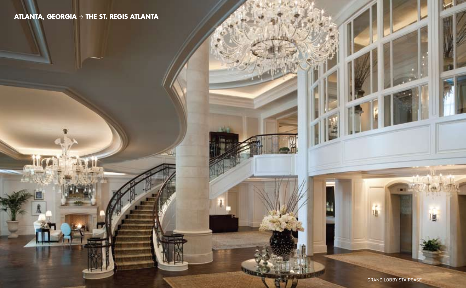
GRAND LOBBY STAIRCASE