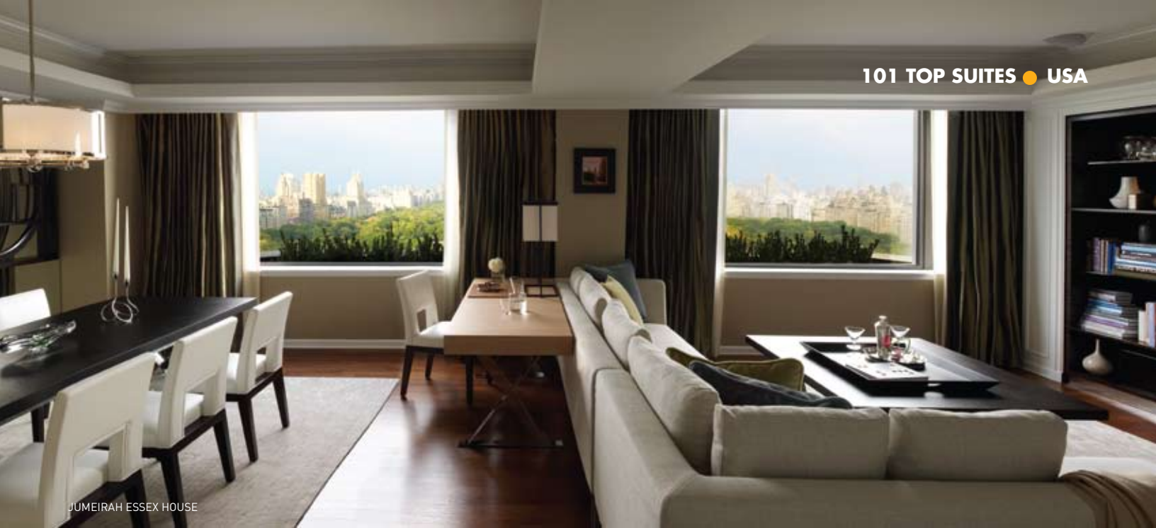
JUMEIRAH ESSEX HOUSE