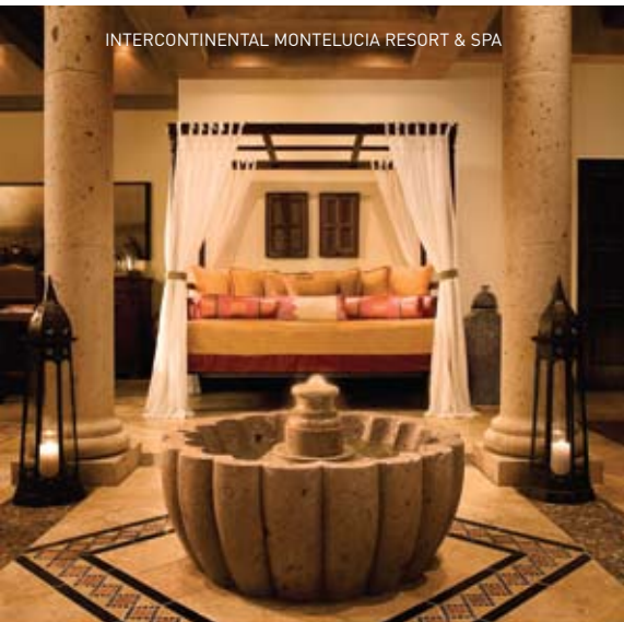
INTERCONTINENTAL MONTELUCCIA RESORT & SPA