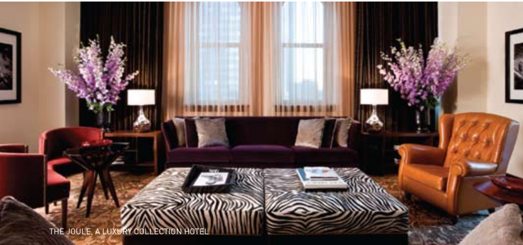
THE JOULE, A LUXURY COLLECTION HOTEL