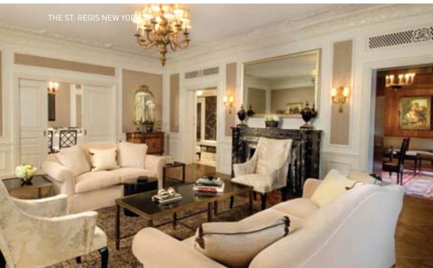
THE ST. REGIS NEW YORK