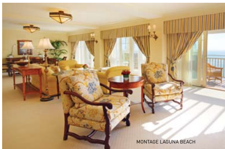
MONTAGE LAGUNA BEACH