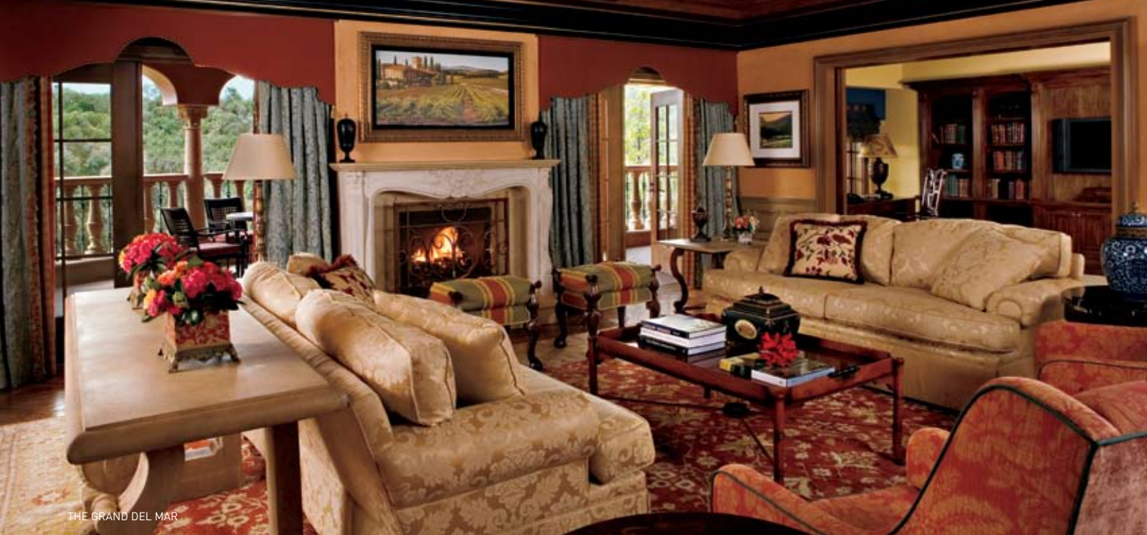
THE GRAND DEL MAR