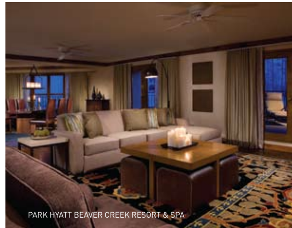
PARK HYATT BEAVER CREEK RESORT & SPA