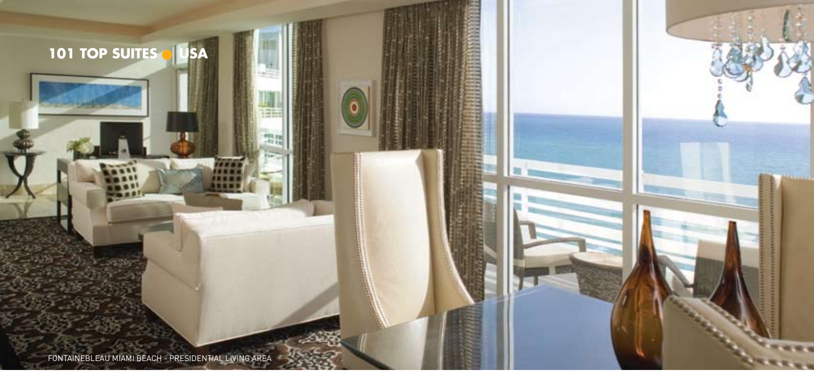
FONTAINEBLEAU MIAMI BEACH - PRESIDENTIAL LIVING AREA