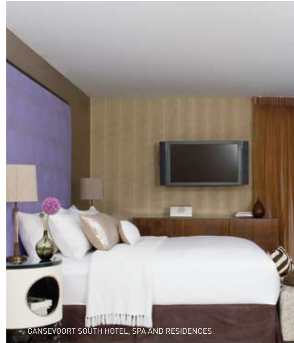
GANSEVOORT SOUTH HOTEL, SPA AND RESIDENCES