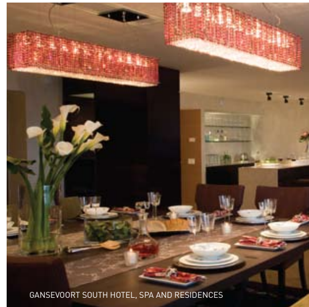
GANSEVOORT SOUTH HOTEL, SPA AND RESIDENCES