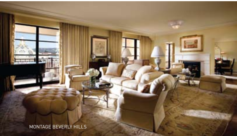
MONTAGE BEVERLY HILLS