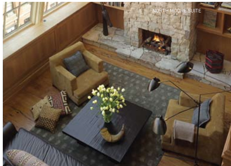
NORTH MOORE SUITE