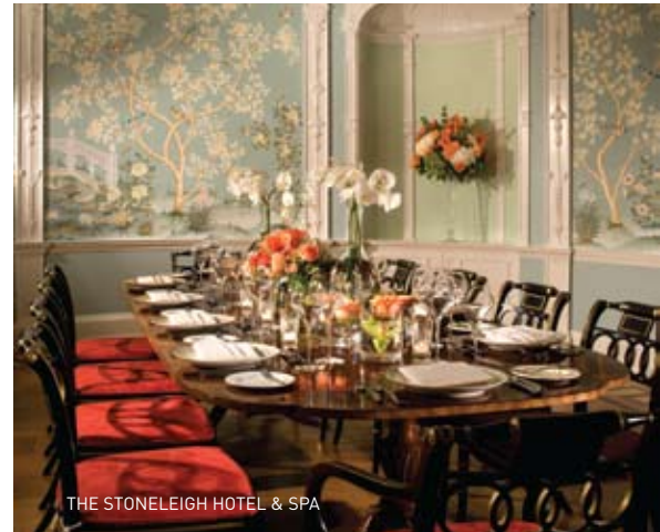
THE STONELEIGH HOTEL & SPA