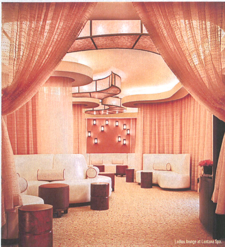
Ladies lounge at Lantana Spa.

At the new J.W. Marriott Resort's Lantana Spa in San Antonio, the theory goes that tying some knots will lead to getting rid of a few. As you enter the light-filled, modern rustic sanctuary that maximizes the healing powers of native Texas plants, you are handed a pristine red ribbon and invited to partake in the "los siete nudos" ritual. Tie seven knots, one for each worry, into a circle, and on the way to treatment, drop in a silver bowl at the foot of a cascading staircase lit by a dangling quartz chandelier. In the soothing, persimmon-toned surroundings, stylishly imagined by Dallas' own Forrest Perkins firm, it's indeed hard to grasp the fact that reality lies just beyond the 26,000-square-foot, hacienda-like spa. Treatments incorporate a Tex-Mex mix of indigenous plants evoking the Rio Grande Valley, as well as healing practices of the legendary curanderos . We indulged in the hydrating sig organic facial and massage using Naturopathica products, shopped the well-edited boutique and grabbed a bite at Replenish, the onsite healthy bistro. 23808 Resort Pkwy., 210.403.3434 or jusanantonio.com