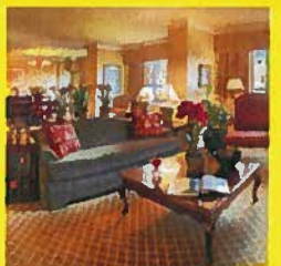
From top: The Four Seasons in Philadelphia; The Ojal boardroom; The Ojal classroom style meeting room; The Rittenhouse chairman suite; The Sanctuary