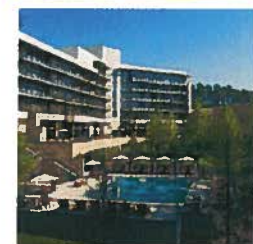
From top: The Rittenhouse Fountain; The Umstead Hotel