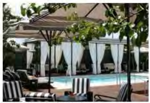
Back to black: the decadent courtyard