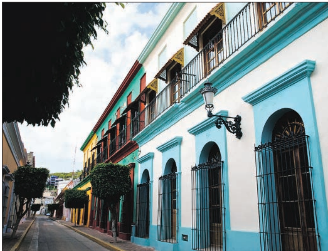
Restored buildings line the narrow streets of Mazatlan's Centro Historico.