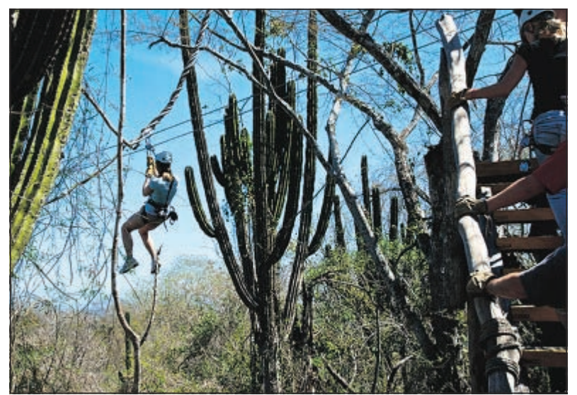
The Huana Coa Canopy Adventure is a series of nine zip-lines near Mazatlan.